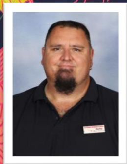
Big Fish - Groundsman